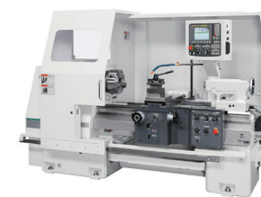
CNC ORDINARY LATHE